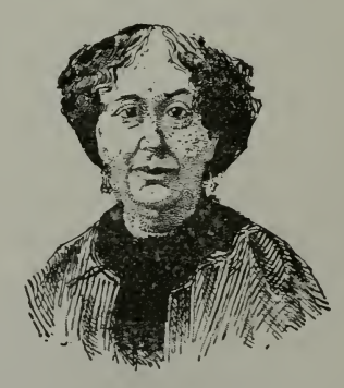
GEORGE SAND In 1869. From a photograph.